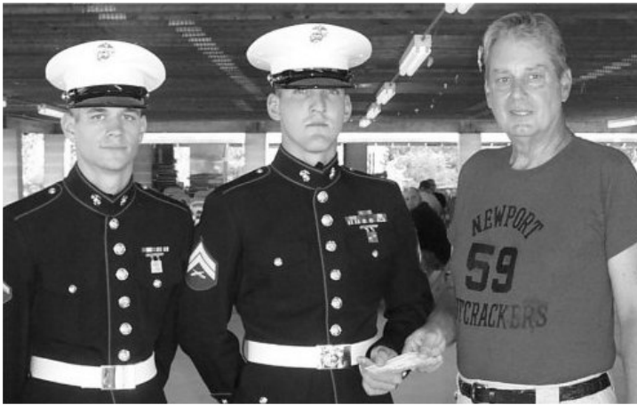
At its Fall Festival the Community Organization donated $100 to the Marines for the Christmas Toys for Tots program

Newport Township has three fire companies: the Consolidated Hose Company of Sheatown and Wanamie, the Glen Lyon Hose company, and the Alden Hose Company. All companies belong to the Newport Township Fire Department and each is eligible for its own respective grants.