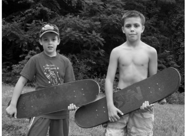
Skateboarders on Rock Street in Glen Lyon

At a special meeting on November 14, 2007, the Township Board of Commissioners accepted one of two bids submitted by J. P. Mascaro for garbage removal in the Township over a period of three years from 2008 thru 2010. The first year removal cost of $266,322 will increase to $308,480 in the third year. This will include the pick-up of one large item per month per residence . The first year's costs to a property owner will be $205 for garbage removal and $30 for recycling fee, a total of $235.